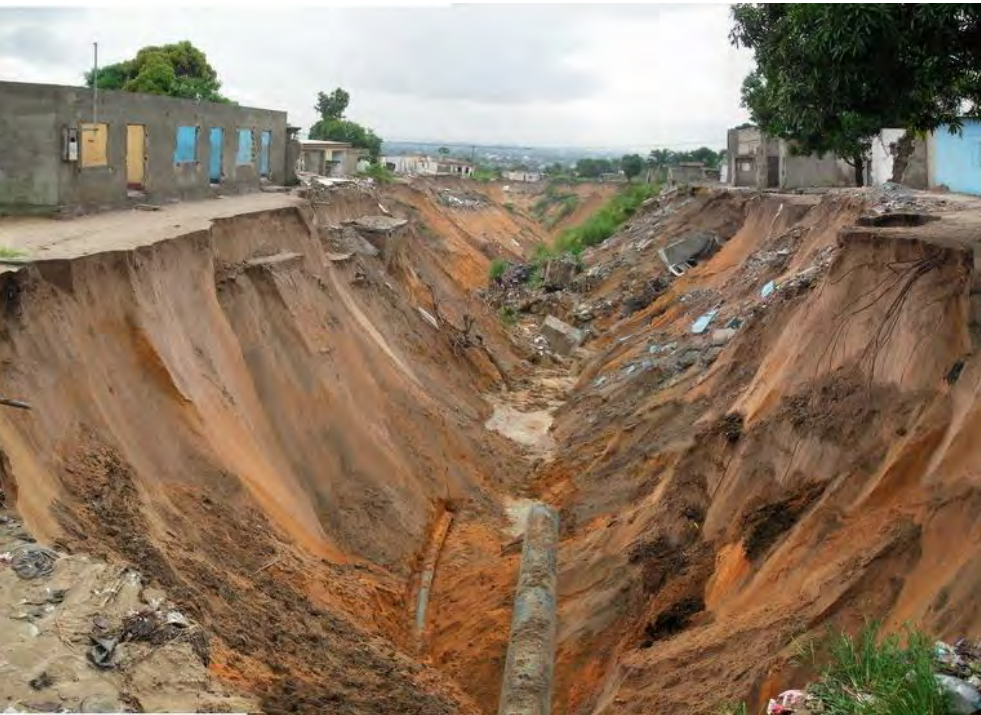
Initial status at the Boukeni ravine, before placing sandbags containing soil and planting vetiver