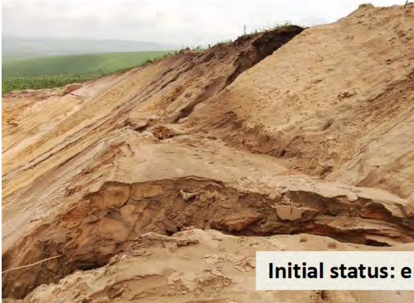
Initial status: eroded embankment

Vetiver was successfully tested on a small part of an eroded embankment before its large scale use.