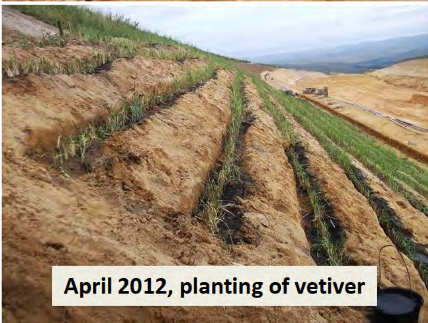
April 2012, planting of vetiver