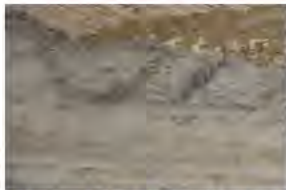
Photo 12. Drève de Selembao erosion control site before vetiver planting and hydroseeding