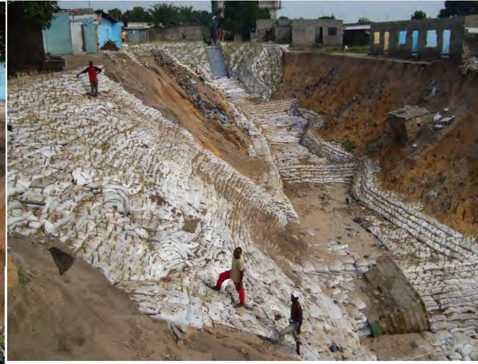
Placing bags containing topsoil and vetiver planting on the Boukeni site (February 2009)