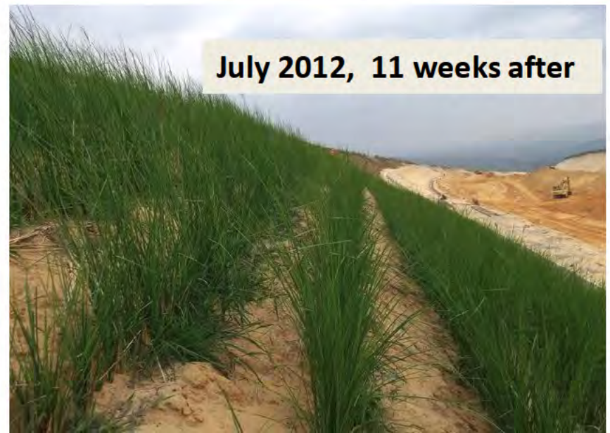
July 2012, 11 weeks after